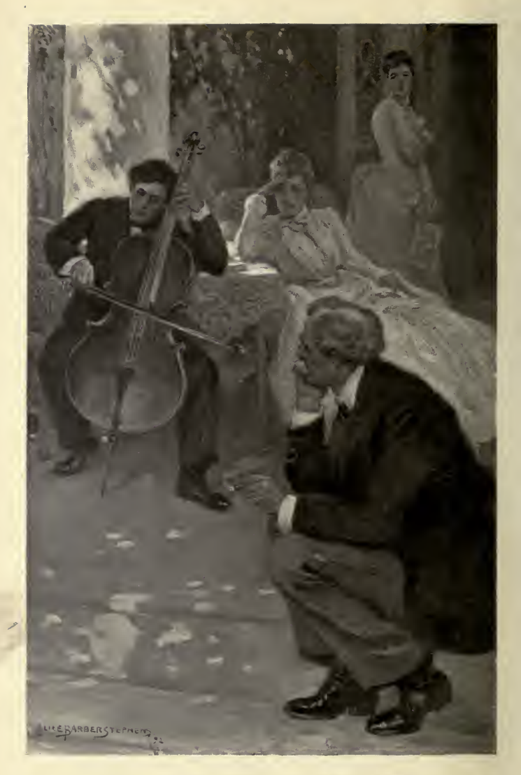
ROME ... GAVE HIS FIRST PERFORMANCE (page 148)